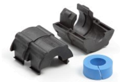
Example of product, sizes 10-20mm

Supplied 2 half shells and a split rubber seal